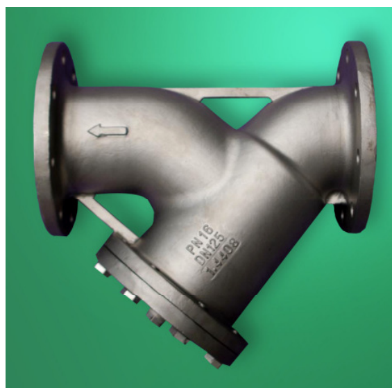
DELTA-YS-12 made of 1.4408