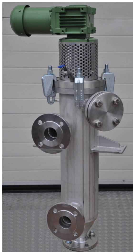
DELTA-STRAIN 200-RS, 1.4571, 10 bar

Automobile industry Chemical industry Electronics industry Paint and lacquer industry Semiconductor industry Cosmetic industry Plastics industry Beverages and food industry Metalworking and steel industry Mineral oil industry Paper industry Pharma industry Water supply and wastewater treatment companies etc.