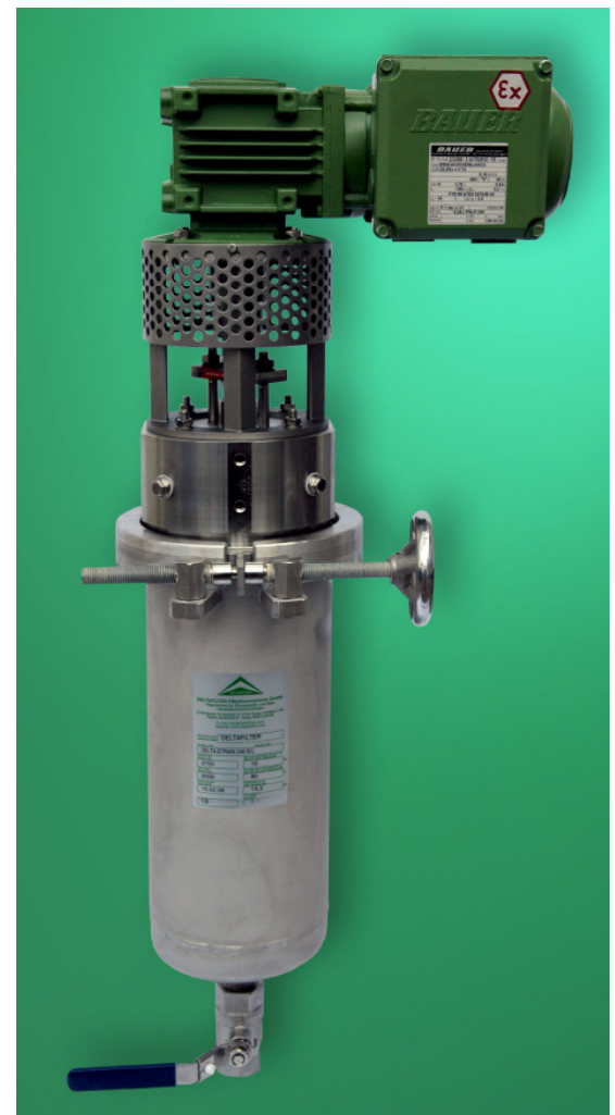
DELTA-STRAIN 240-S/L, 1.4571, 10 bar

Automobile industry Chemical industry Electronics industry Dye, paint and lacquer industry Semiconductor industry Cosmetic industry Plastics industry Beverages and food industry Metalworking and steel industry Mineral oil industry Paper industry Pharma industry Water supply and wastewater treatment companies etc.